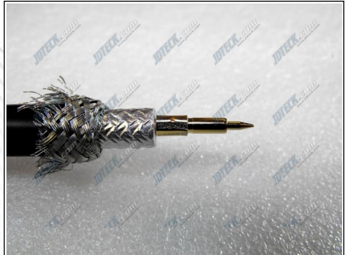
Check for good solid crimp.