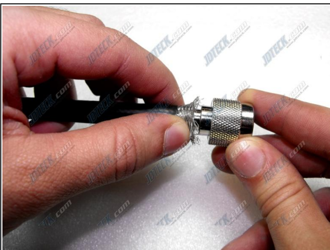
Slide up braid over the connector.