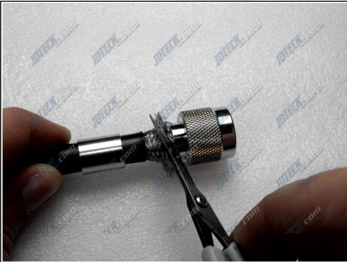
Use small scissors to trim off excess braid pass the kink .