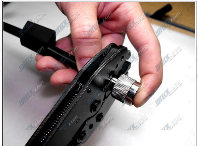
Use thumb to hold sleeve and index to hold connector.