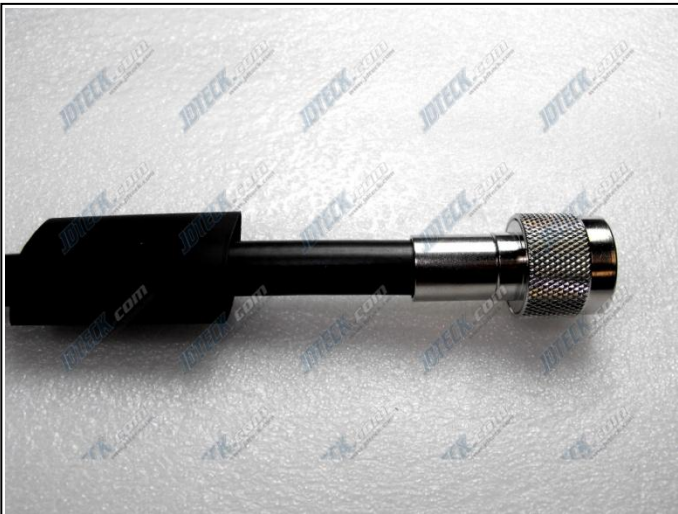
Slide up sleeve and make sure no excess braid is showing.