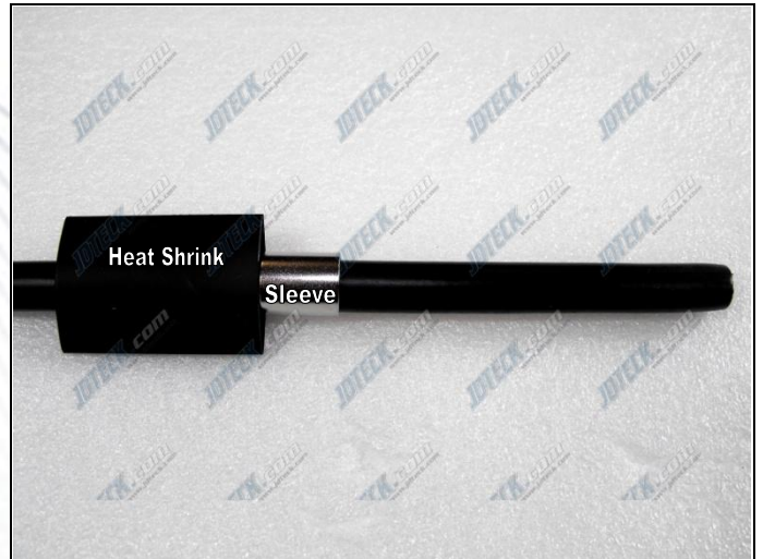
Slide heat shrink and connector sleeve on cable.