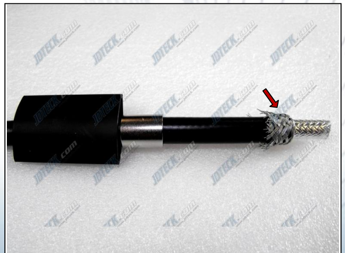
Peel back the braid. Be careful not to disrupt the pattern.