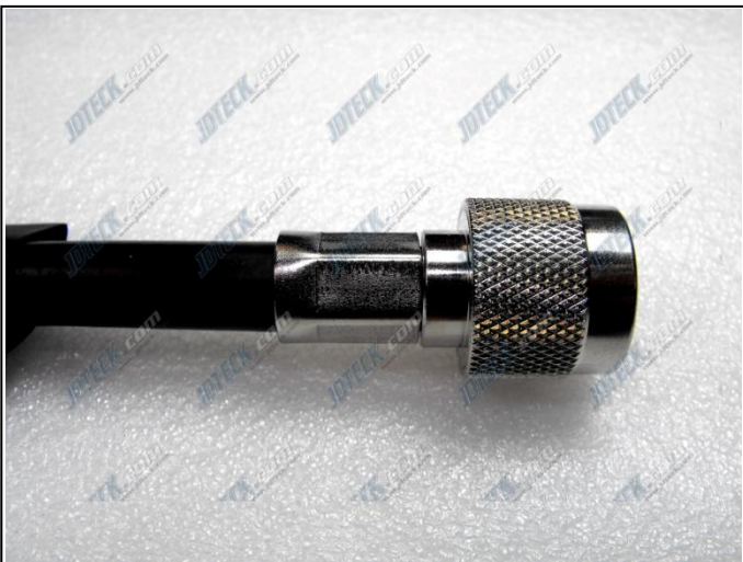
Crimp should look like this. Pull on connector to be sure.