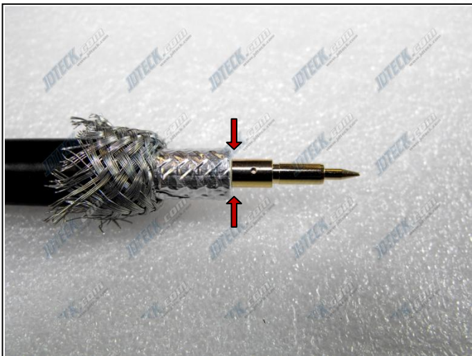
Brass pin should be snug fit with dielectric.