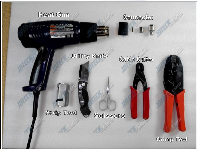
Tools required to terminate connector.