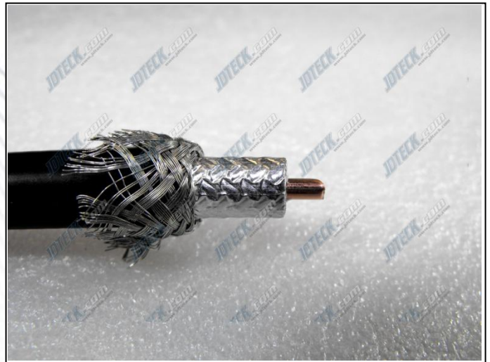
With the dielectric removed, it should look like this.