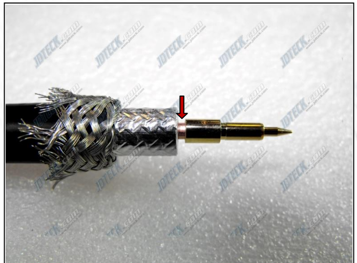
If more than 3/16" is exposed after checking, please redo!