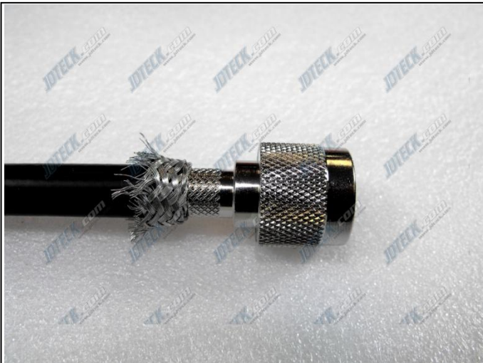
Place connector on cable.