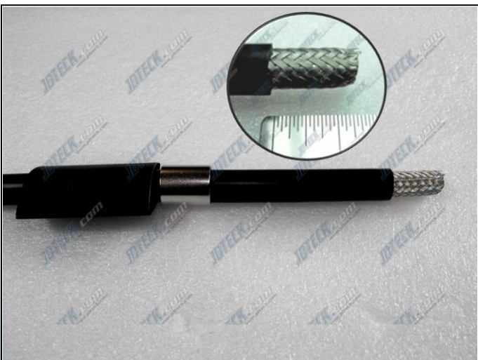
3/4" of jacket will be removed by the tool.