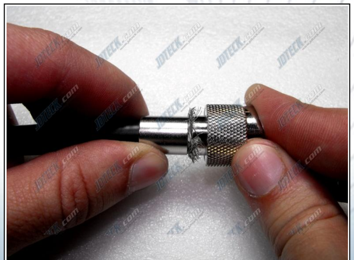
Slide up sleeve and press hard to make kink in braid.