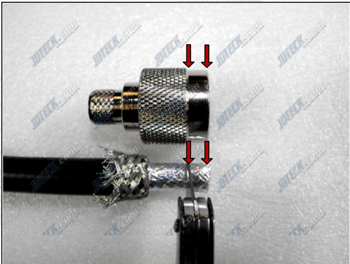
Use connector as a guide to remove dielectric with knife.