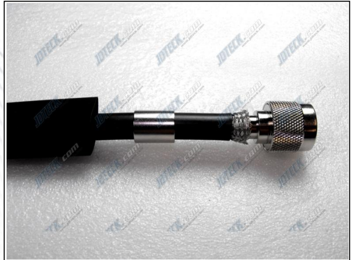
Your braid should look like this when finished.