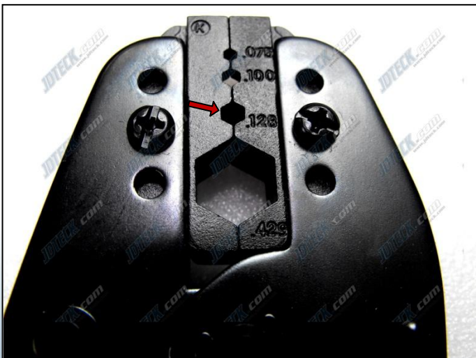
Use 0.128 die to crimp center brass pin.