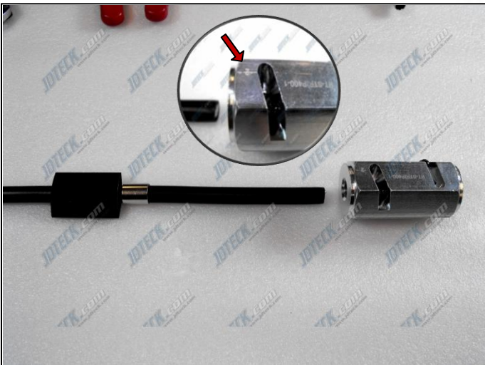
Using side (2) of strip tool, remove outer jacket.