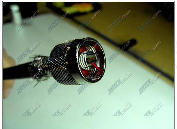
Make sure brass pin is about flush with connector face.