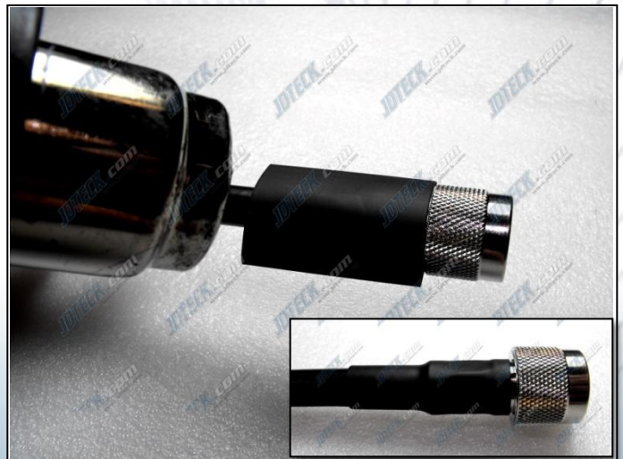
Slide up heat shrink and apply heat. Joint Complete!