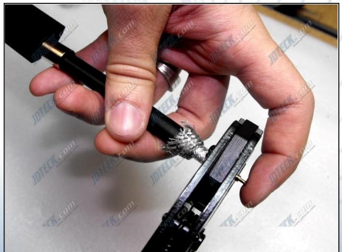
Use index finger to hold brass pin in place while crimping.